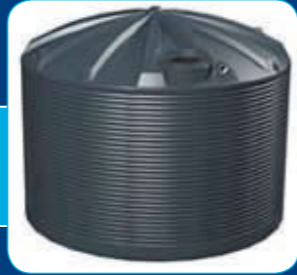
31,700Lt Round 4100(D) 2610(H) M2P31700