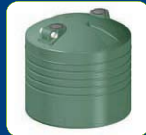
7500Lt Round 2280(D) 2115(H) M2TA7500