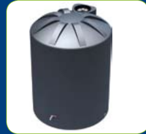
3300Lt Round 1500(D) 2030(H) M2B3300