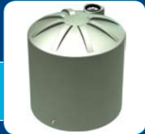
11,000Lt Round 2500(D) 2640(H) M2B1100