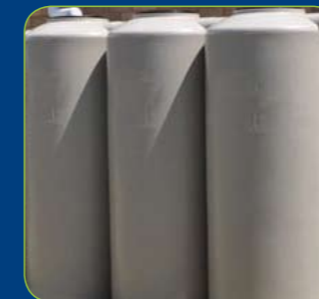
5000Lt Slimline Modular 1050(W) 3190(L) 2100(H) M2UP5000S