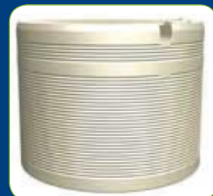
50,050Lt Round 4400(D) 3420(H) M2TP50050