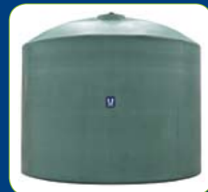
26,000Lt Round 3500(D) 3100(H) M2UP26000