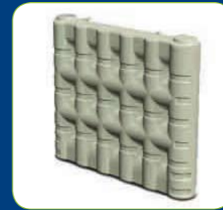
1250Lt Slimline 365(W) 2400(L) 1995(H) M2EGR1250S