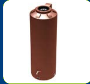
700Lt Round 700(D) 2050(H) M2B700