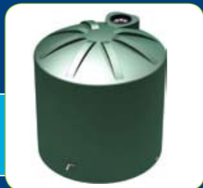
5500Lt Round 2000(D) 2100(H) M2B5500