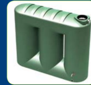
3500Lt Slimline 800(W) 2650(L) 2230(H) M2B3500S