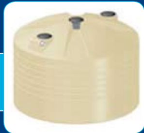
22,500Lt Round 3580(D) 2530(H) 2730(H) M2TA22500