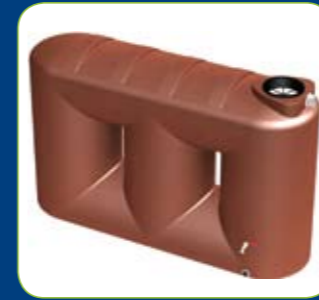
2100Lt Slimline 750(W) 2500(L) 1550(H) M2B2100SLP