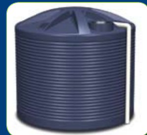
13,700Lt Round 2860(D) 2585(H) M2AP13700